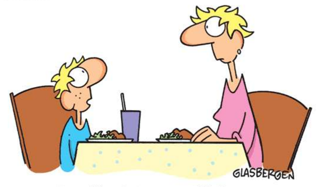
"Some religions don't eat meat on Friday because there's separation of church and steak."