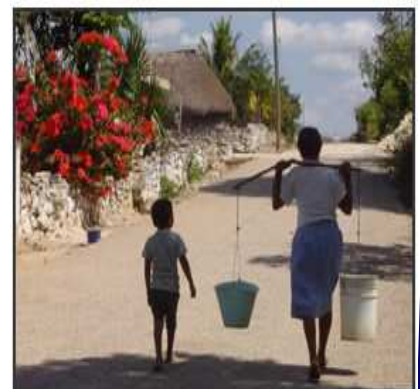
Xmaben, Mexico: Contaminated well water must be hauled and then boiled, using precious fuel and human energy.